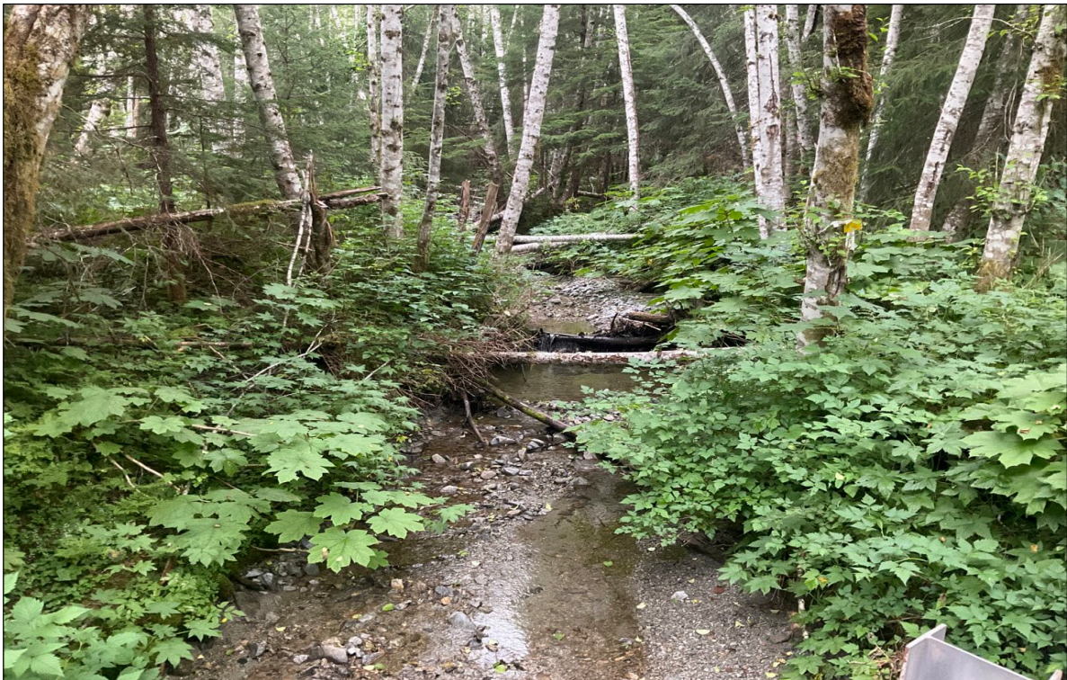
Figure 2. Channel downstream of bridge at waypoint 478.