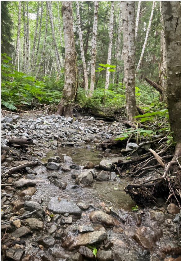
Figure 4. Upstream channel at waypoint 510.