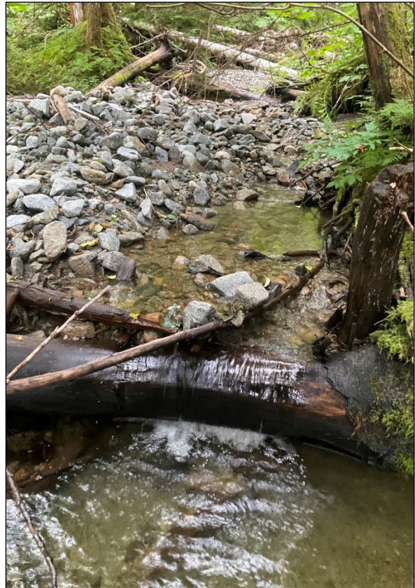
Figure 5. Upstream channel at waypoint 508.