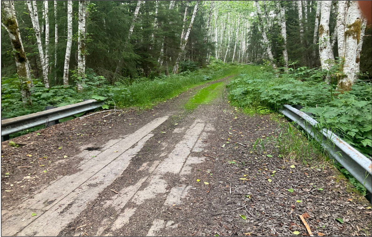
Figure 1. Bridge at waypoint 478.