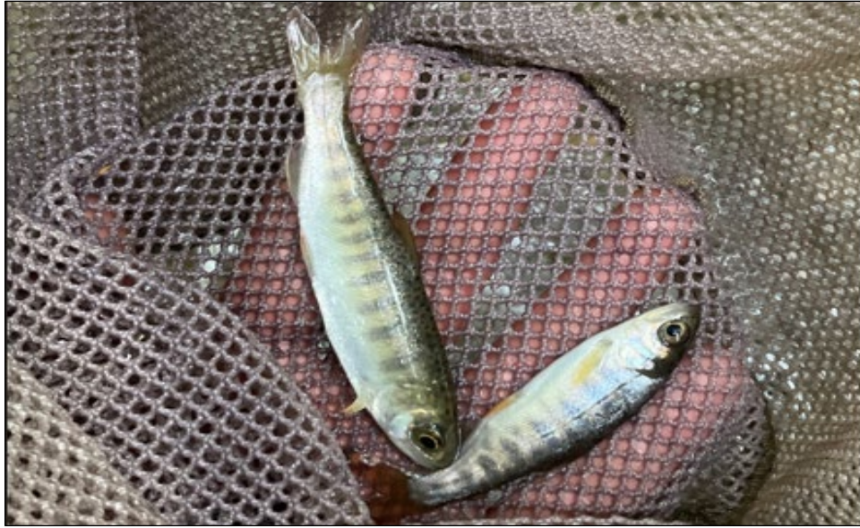
Figure 3. Juvenile coho salmon caught at waypoint 510.